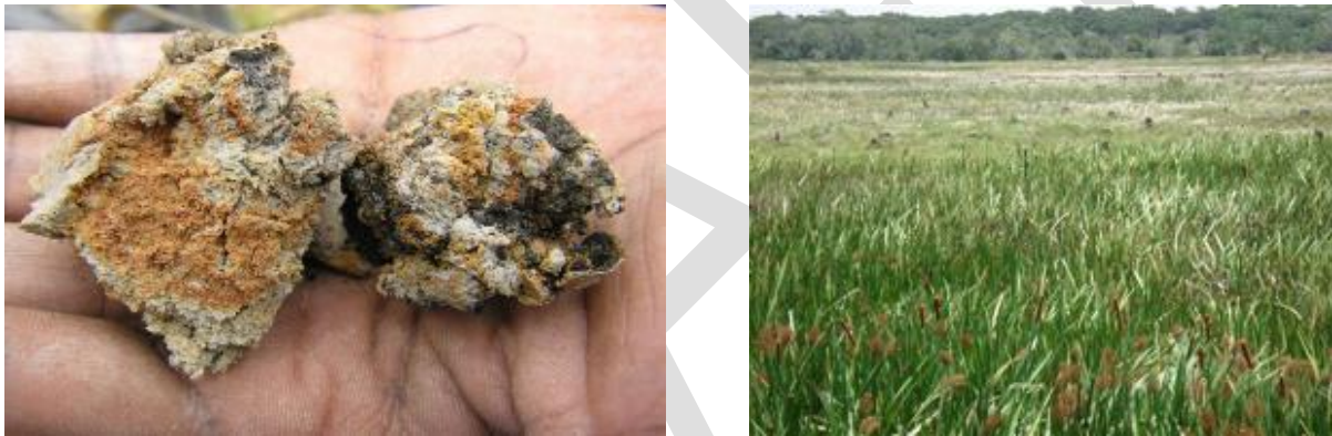
Figure 1 & 2: Mottled soils indicative of a wetland (left) and specially adapted wetland vegetation (right).

In simpler terms, a wetland is a feature in the landscape which is saturated with water for a long enough period that the soil conditions change (mottling as a result of the anaerobic conditions) and the vegetation shifts to respond to these changes.